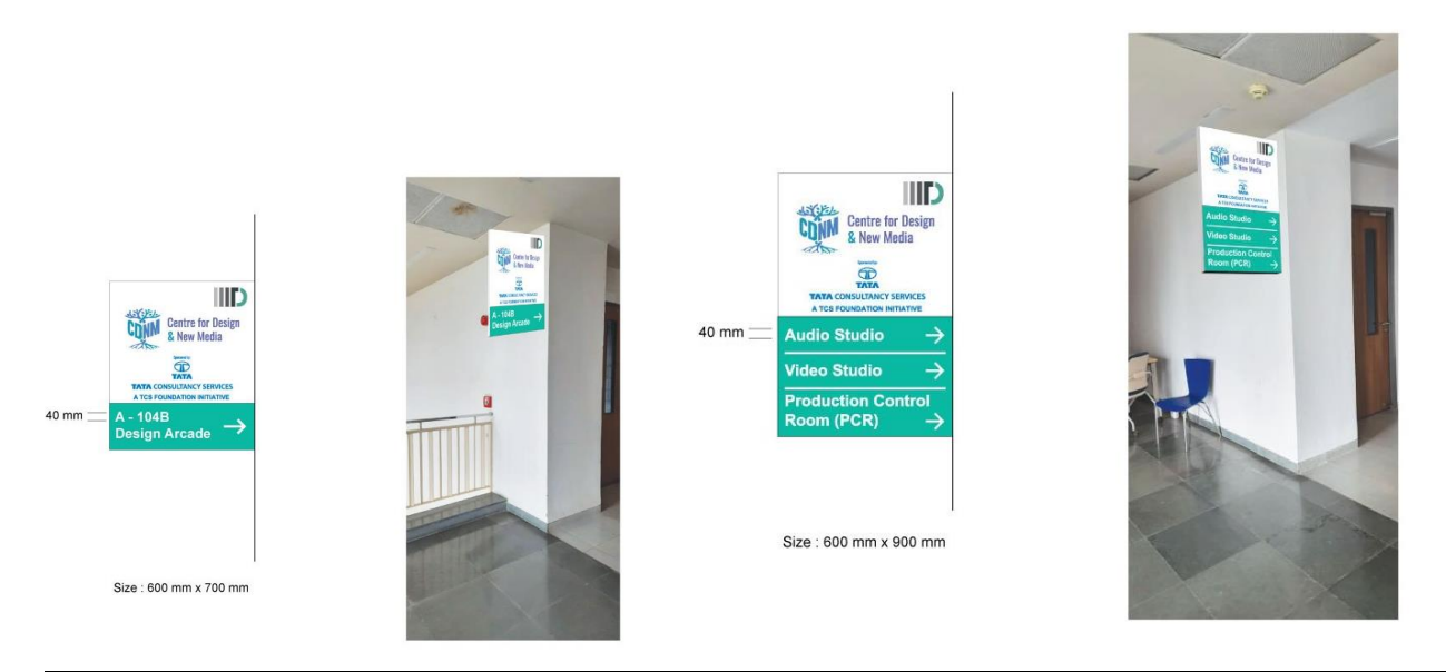
Detailed drawing no-3